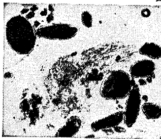
1. Home strained vegetables after 2 hours.

Experiment in vitro on digestibility of food.